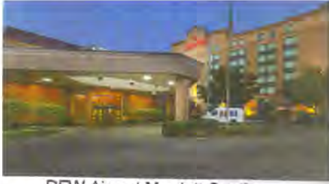
DFW Airport Marriott South

4151 Centreport Boulevard Fort Worth, TEXAS 76155